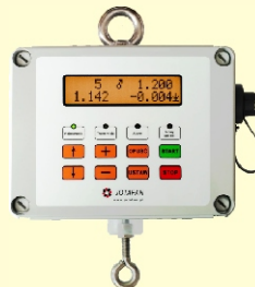
Manual scales WGJ-R