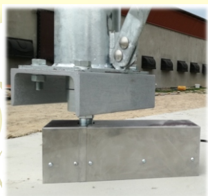
The illustration of silos weighing in the JOTAFAN FARM program